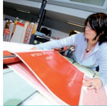
An integral part of modern communications

The second edition of the Vinyl 2010 Essay Competition involving the younger generation in the dialogue on sustainable development was extremely successful. The results of the Essay Competition were presented