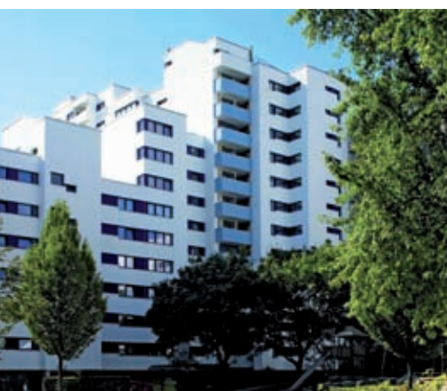
Cobalt blue frames with integrated vents – looking good, enhancing life and saving energy

Despite generally difficult market conditions, the European PVC industry maintained its determination in pursuing its sustainability targets and objectives also in 2009.