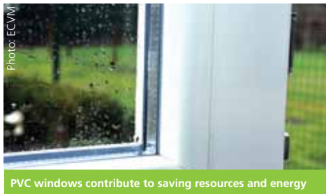
PVC windows contribute to saving resources and energy

Sustainable Energy Use: We will help to minimise climate impacts through reducing energy and raw material use, potentially endeavouring to switch to renewable sources and promoting sustainable innovation.