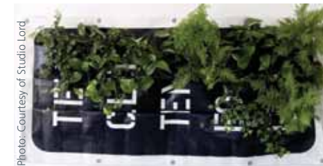
WallGreen, a vertical garden made from recycled PVC banners

Sustainable Additives: We will review the use of PVC additives and move towards more sustainable additive systems.